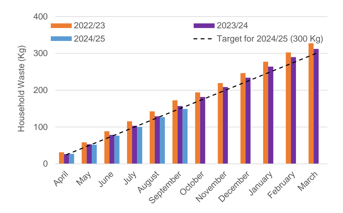
Figure 1: Residual Waste per Household (Kg), 2022/23 to present.